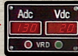
Welding DSP Voltmeter/Ammeter & VRD indicator light

The front panel of the DSP control unit is provided with a military type circular connector which can be connected to a MOSA remote control unit or wire feeder, for MIG MAG. When plugging an external connector the control is automatically switched from the front panel knob to the knob on the remote unit. All the machines of this series are equipped with digital meters to monitor the welding current and voltage.