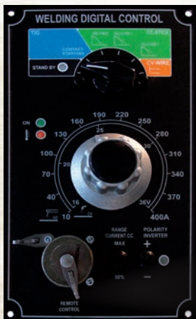
control panel digital

The software of the control unit, depending on the version of welder on which it is installed, can handle various functions, including: